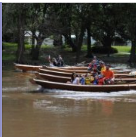
Acadian Memorial 2012 Festival photos courtesy of Ralph Melancon