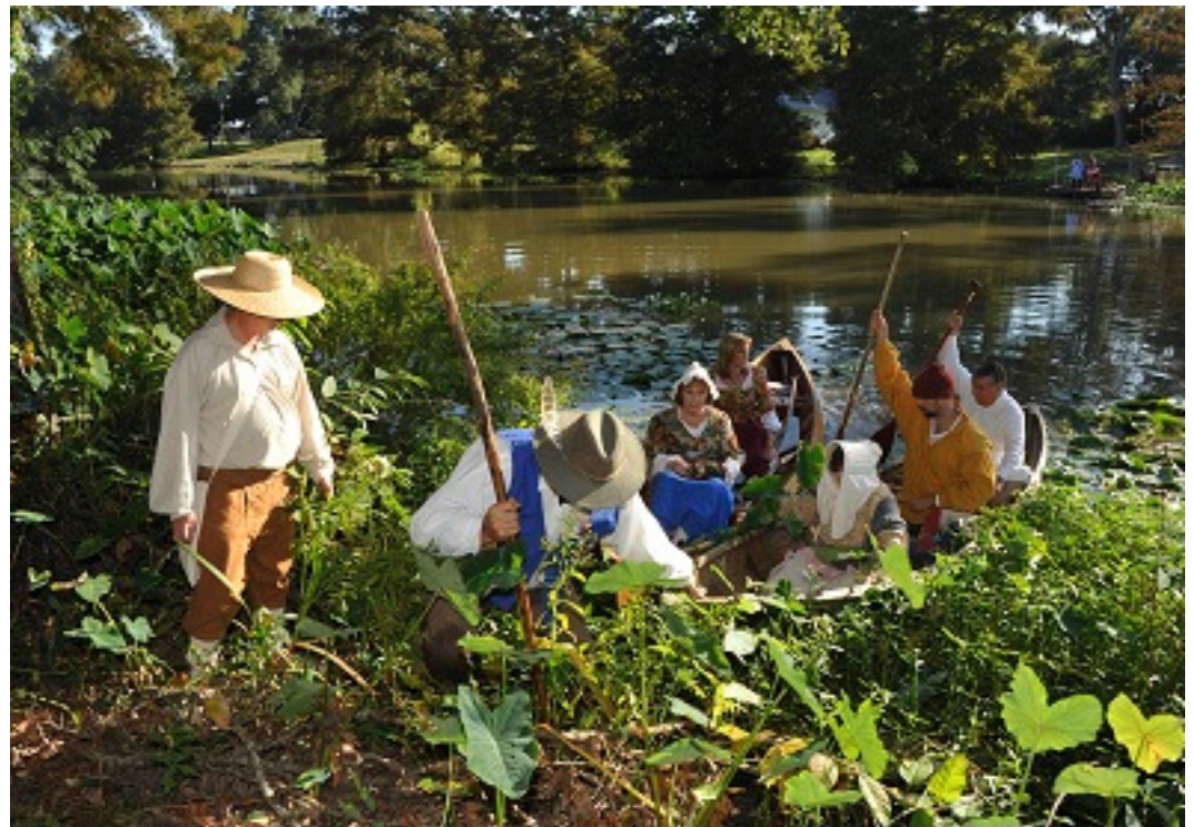
Re-Enactment of the Arrival of the Acadians