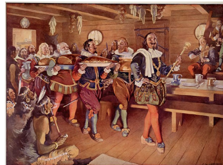
"The Order of Good Cheer," a 1925 painting by Charles William Jefferys, depicts the first L'Ordre du Bon Temps event. The image is housed in the Library & Archives of Canada.