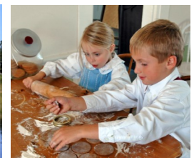
Hands-on activities at Le Village: cookie making