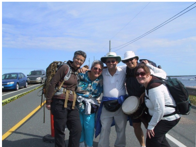
At the top of Miscou Island Bridge, with new friends.