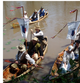
2009 Reenactment: The Acadians' arrival on the Teche in St. Martinville.