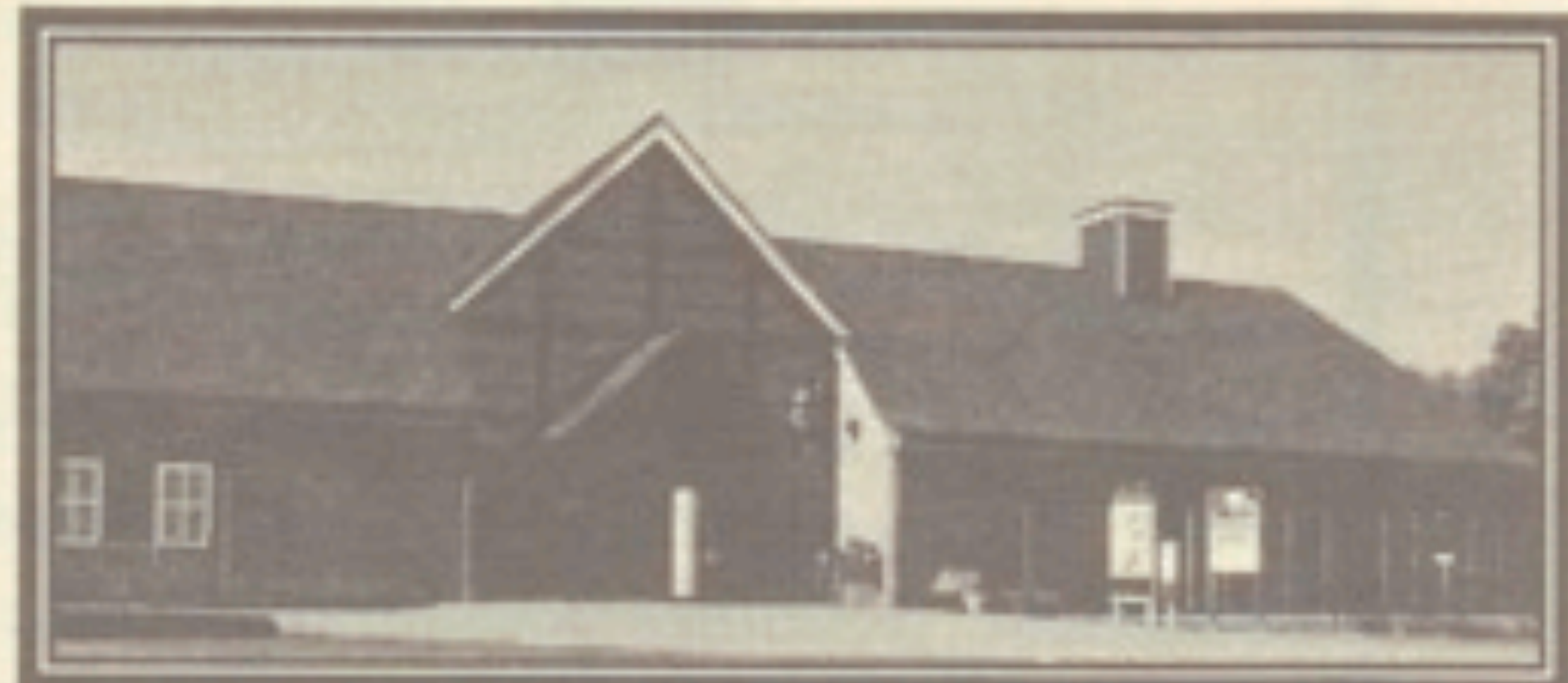
Grand-Pré Interpretative Center