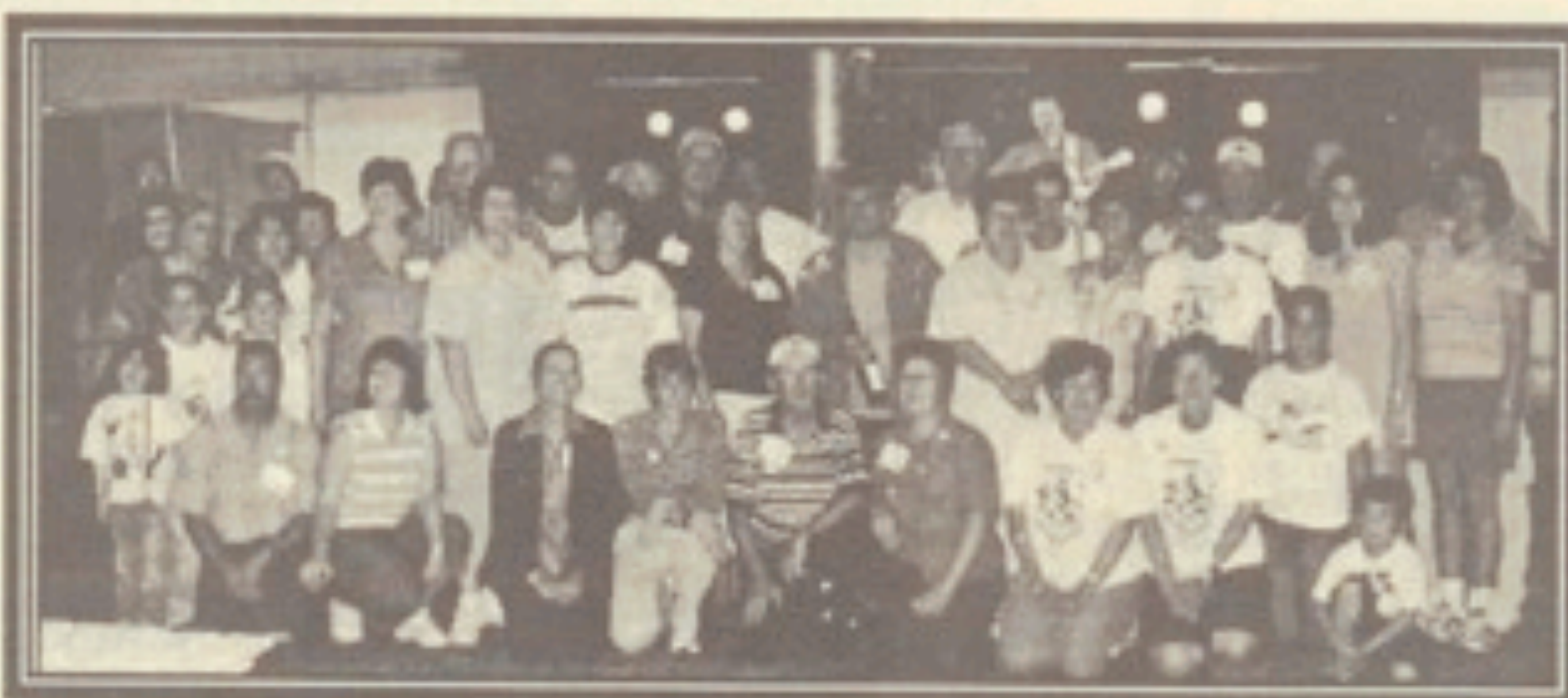
Thibodeaux Family from Louisiana