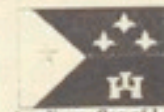
Acadiana flag of LA