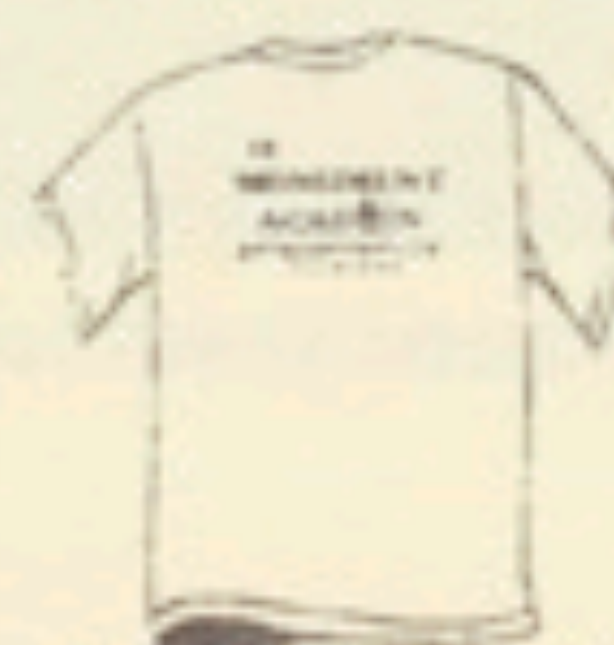
mural T back / dos

Cajun T-shirt - "Cajuns of Acadian Descent". Lists some Cajun surnames on the back and Memorial logo on front. $15