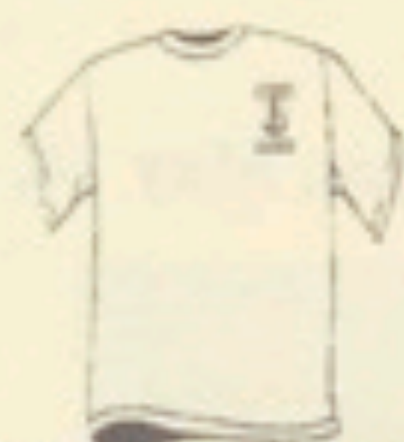
Cajun T front / devant