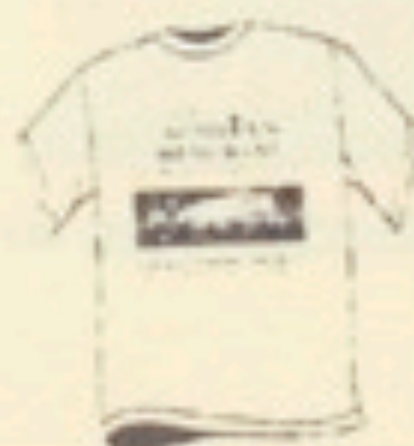
mural T front / devant