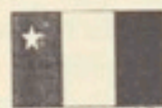
Acadian national flag