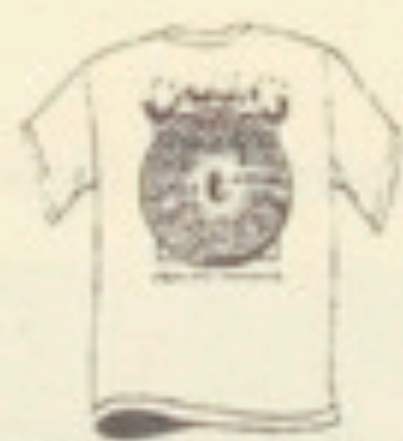
Cajun T back / dos

Mural T-shirt - full color mural on 100% white cotton. Acadian Memorial name in English on front, en français on back. Youth M or L. Adult S, M, L, XL, XXL, XXXL. $18