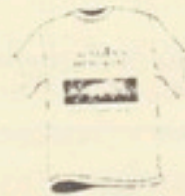
mural T front / devant