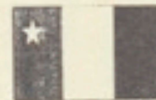
Acadian national flag