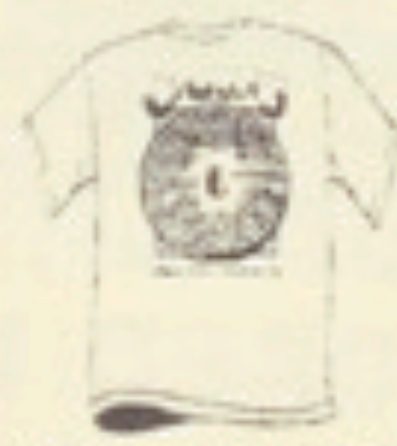
Cajun T back / dos

Mural T-shirt - full color mural on 100% white cotton. Acadian Memorial name in English on front, en français on back. Youth M or L. Adult S, M, L, XL, XXL, XXXL. $18