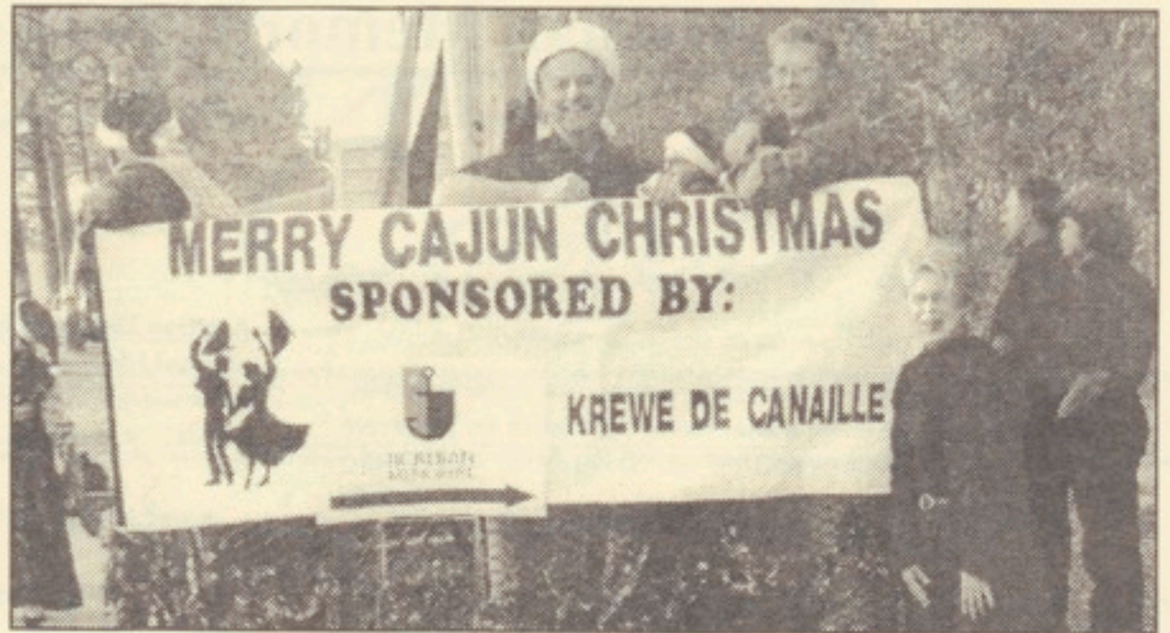
Above and Below: Acadian Memorial Float wins 1st Place in "Business Category"