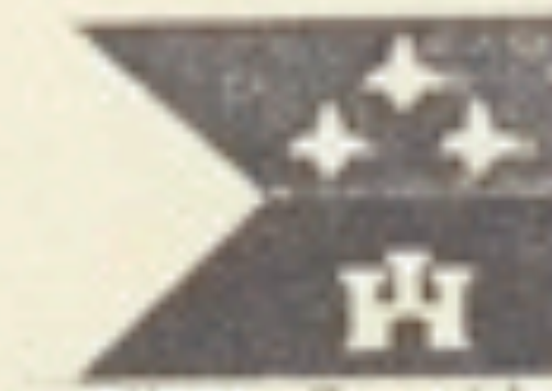
Acadiana flag of LA