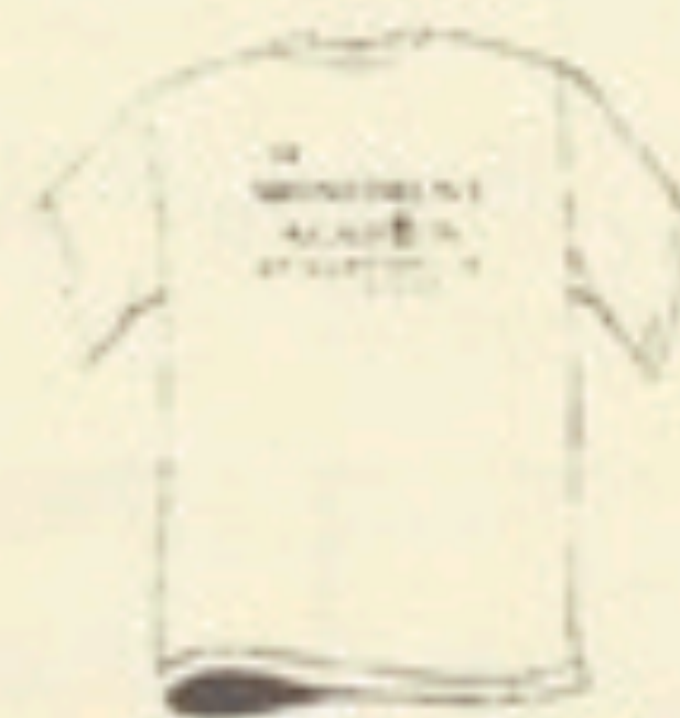
mural T back / dos

Cajun T-shirt - "Cajuns of Acadian Descent". Lists some Cajun surnames on the back and Memorial logo on front. $15