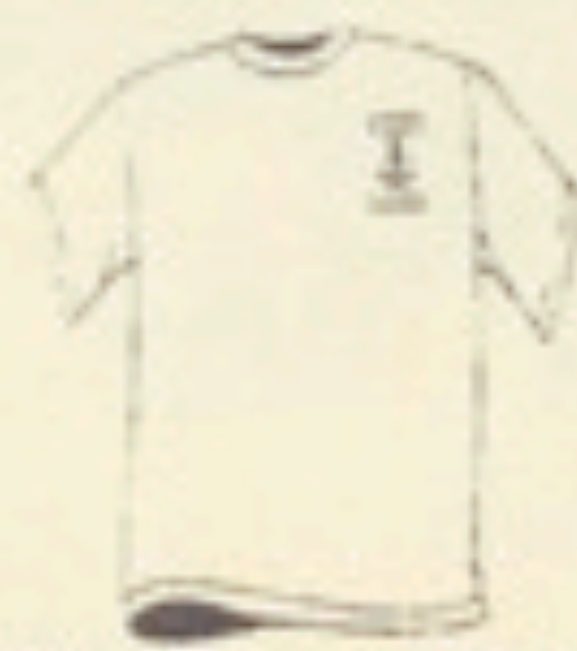
Cajun T front / devant