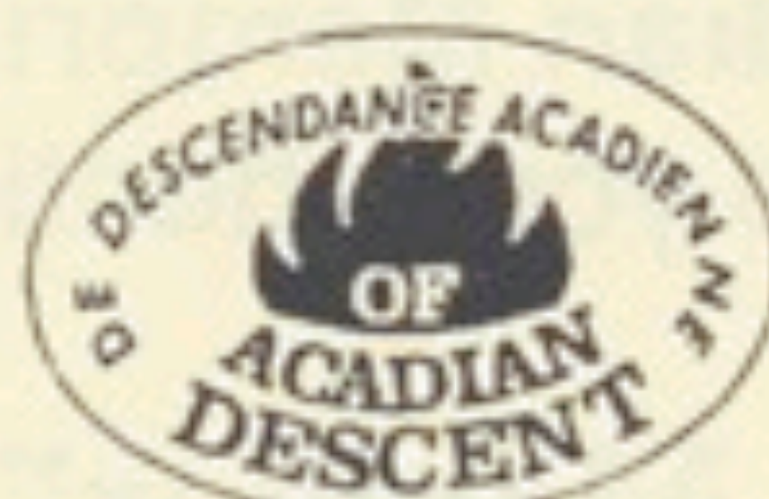
Acadian Descent Pin